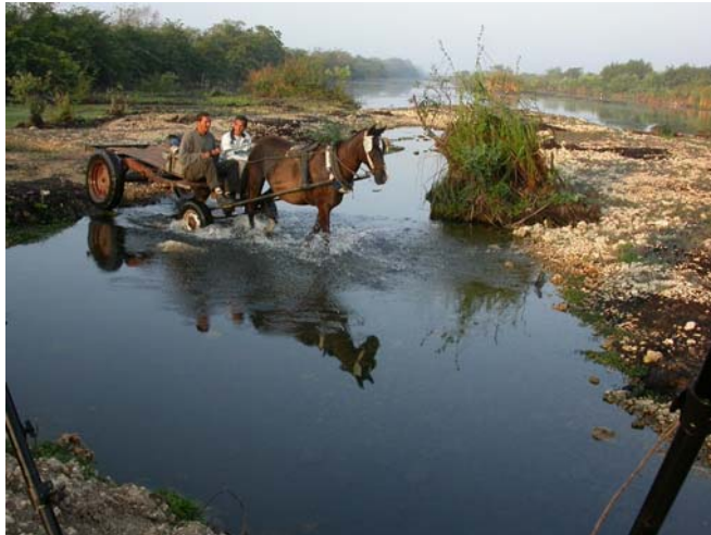
Passing Canal de Soplillar

Zapata: Playa Larga – Playa Girón 13.20 – 15.00. We followed the road along the coast the 32 km and back again. Though having been warned against crashing the crabs on the road we managed to have punctures on two tyres. They were simply all over, which the Turkey Vultures