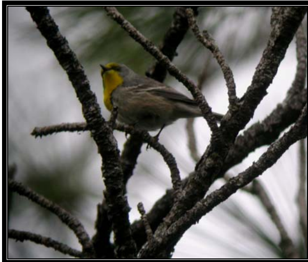
Olive-capped Warbler was locally abundant at La Güira