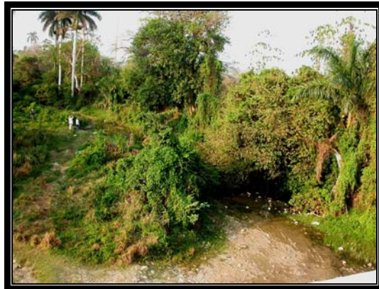
Luxuriant site 31 km west of Ciego de Ávila at El Perico