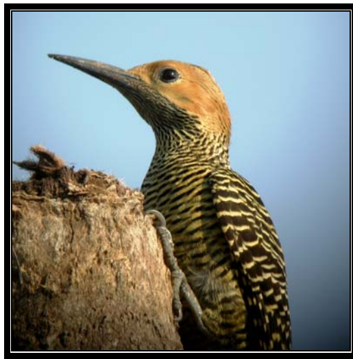
Fernandina's Flicker, Soplillar

2 Playa Larga – Soplillar, 1 Soplillar, 2 Canal de Soplillar + Los Sábalos, 1 Belén.