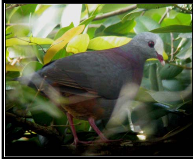
Grey-headed Quail-Dove, Los Sábalos, Zapata