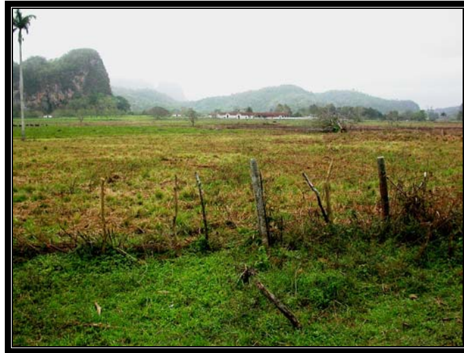
Viñales - the place for Cuban Solitaire