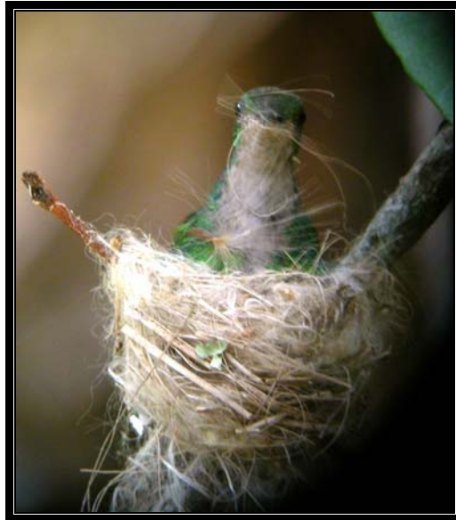
A Cuban Emerald had put its tiny nest over the path