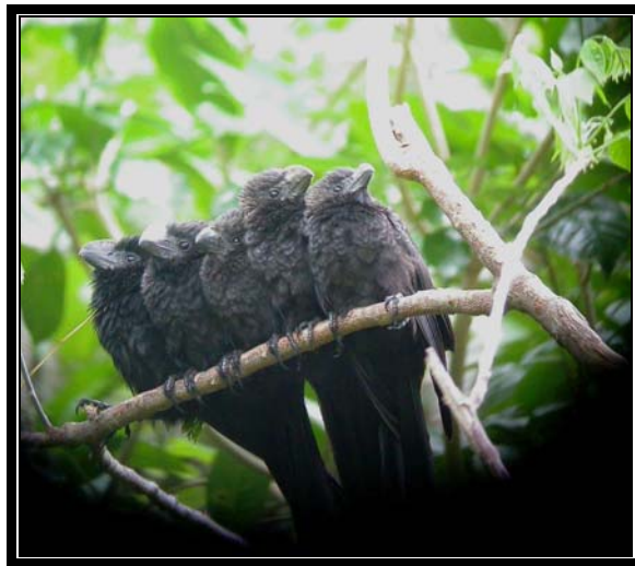
Smooth-billed Anis Going to Sleep, Viñales

3 La Habana – Cuatro Caminos, 1 found dead Río Habánana – River west of Taguasco.