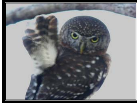
Cuban Pygmy-Owl on the watch-out

On our way home we had a fruitless try for Stygian Owl in Playa Larga.