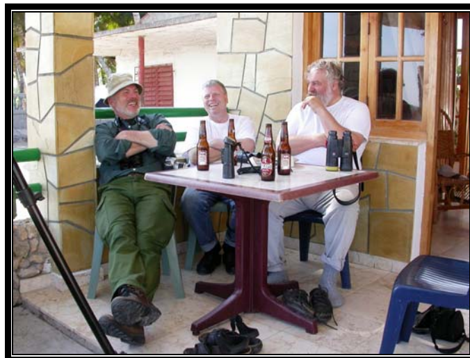
Bins on stand-by. Siesta at Fidel's

Chestnut Mannikin Lonchura malacca 150 Río Habánana, 400 31 km west of Ciego de Àvila at El Perico.