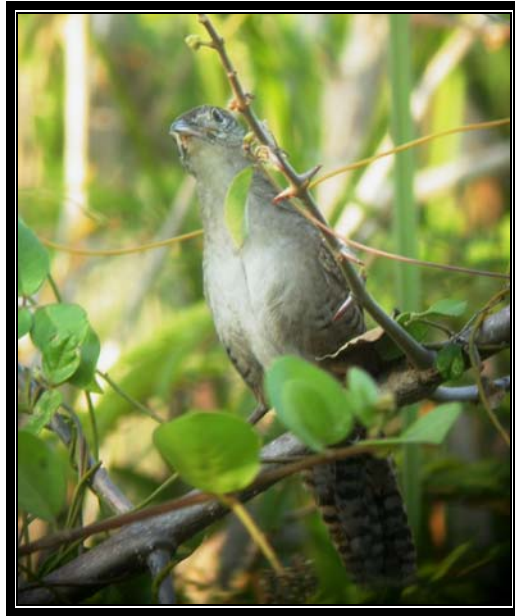
Zapata Wren, El Carmelo, Zapata