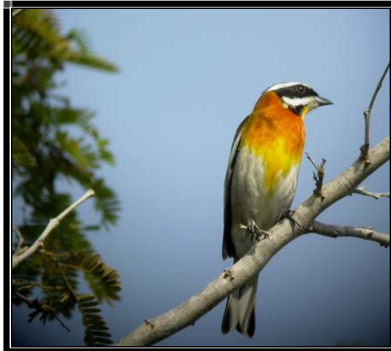
Stripe-headed Tanager – a common beauty all over Cuba